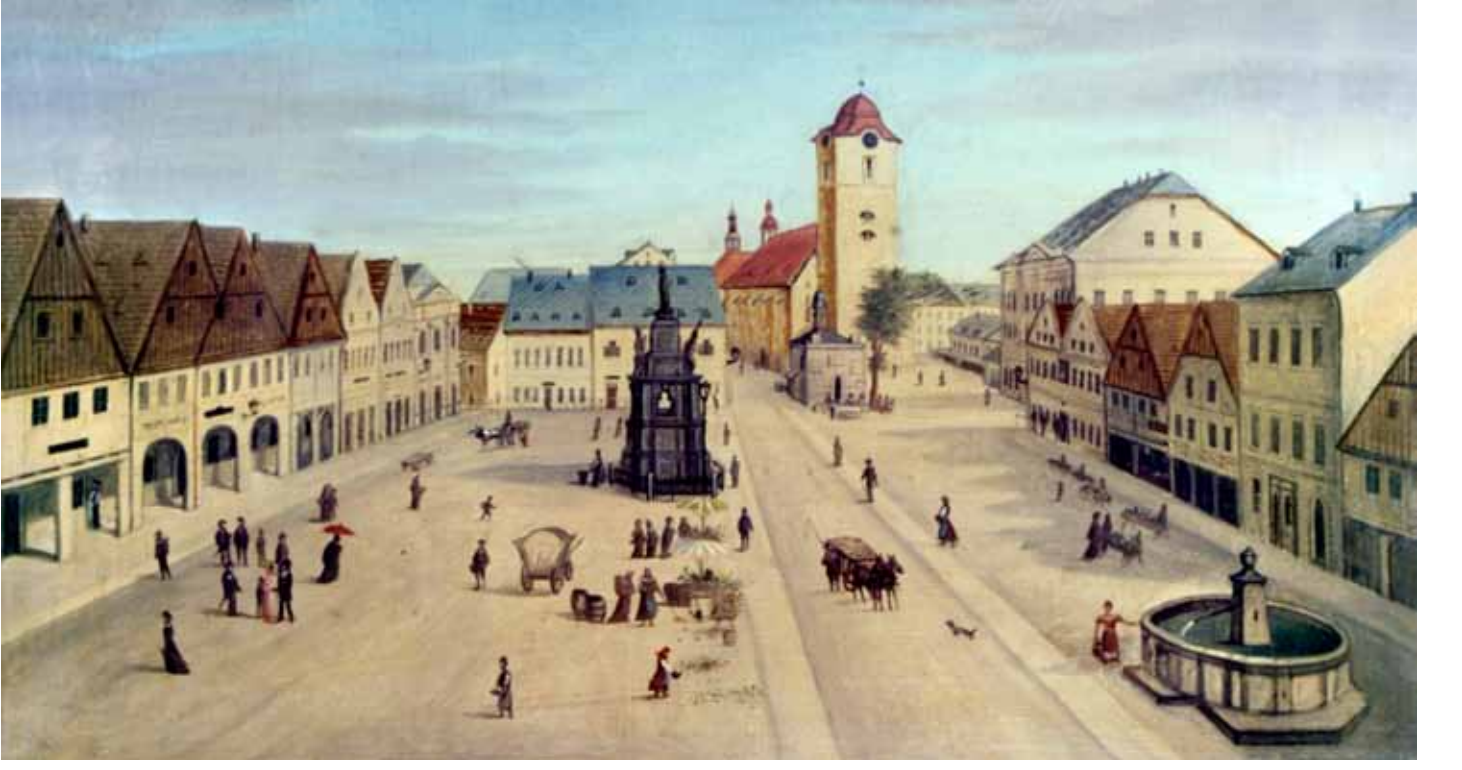
The column was originally located in Novoměstské Square, along with the Chapel of the Holy Sepulcher seen in the background of the 1860s depiction. The chapel can now also be found in the garden of the Church of the Finding of the True Cross.