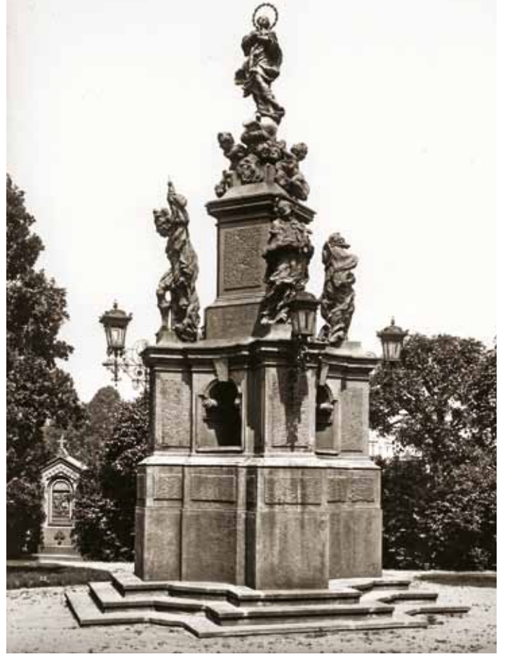
Column with the statues of the Virgin Mary and the Saints in the garden of the Church of the Finding of the True Cross. One of the Stations of the Cross is visible in the background. Photo from around 1930.

The Column was finally transferred in the autumn of 1877. Shortly afterwards, however, voices emerged calling for its return to the original location. In 1900, a budget was even drawn up for the Column's return to the then Bismarck Square. In the new location, however, nothing threatened the column and the place seemed dignified enough. In the end, the monument remained in the church garden for good. In the next century, renewed acceptance of the Baroque style meant that the Column was both given recognition for its artistic qualities, but also received more or less successful repairs. In 1909, the base of the column was stripped of the linseed oil coating which it had borne since 1878. Linseed oil was entirely unsuitable for sandstone, but was unfortunately in common use in the 19th century. In 1937, the column underwent extensive renovation, this time under the supervision of the State Heritage Office. However, the works carried out by Josef Senze from Liberec, as well as the previous interventions, were viewed very critically and were found lacking both in execution and expertise.