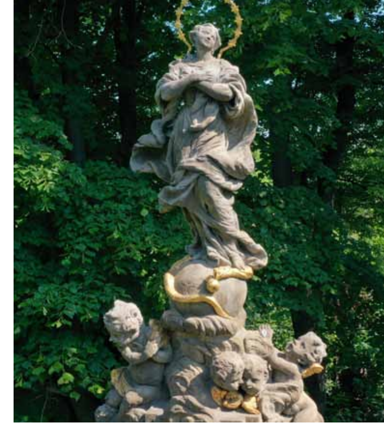
Statue of the Virgin Mary

a tree, and the expression of his face turned towards the Heavens, leaves no room for doubt about the artist's mastery. This is finally confirmed by the statue with which the whole work culminates, the Immaculate Virgin Mary. This most powerful and beloved protector stands on the earthly Sphere, emerging from the clouds surrounded by angels with conspicuously prominent noses, encircled by a serpent clutching an apple in its fangs. Clad in flowing, draped robes, crowned with a halo of twelve stars, she holds her arms crossed on her breast and turns her lovely face to the Heavens. It is the details of the figures of the saints, the expressions on their faces, the decorative hems of their garments and the dynamic modelling of the figures as such that, together with the amazingly captured expressions of intense emotion, make the sculptural monument stand out among similar others in the Liberec region, and incomparable to any other local works.