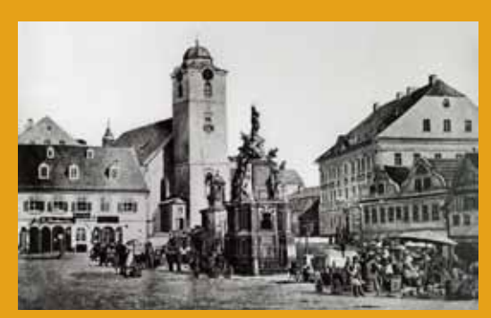
The Marian Column in its original location in the former Novoměstské Square. The column stood in this central location from its erection in 1719 until its transfer in 1877. Depiction before 1870.