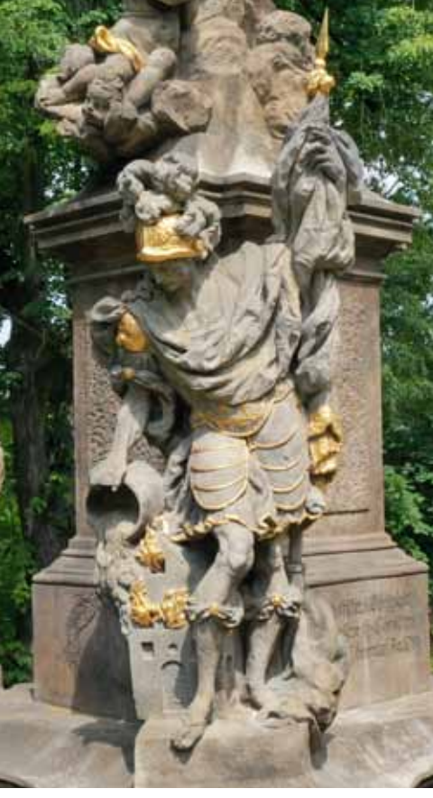
Statue of St. Florian.

he sculpture placed on this massive pedestal is carved from first-