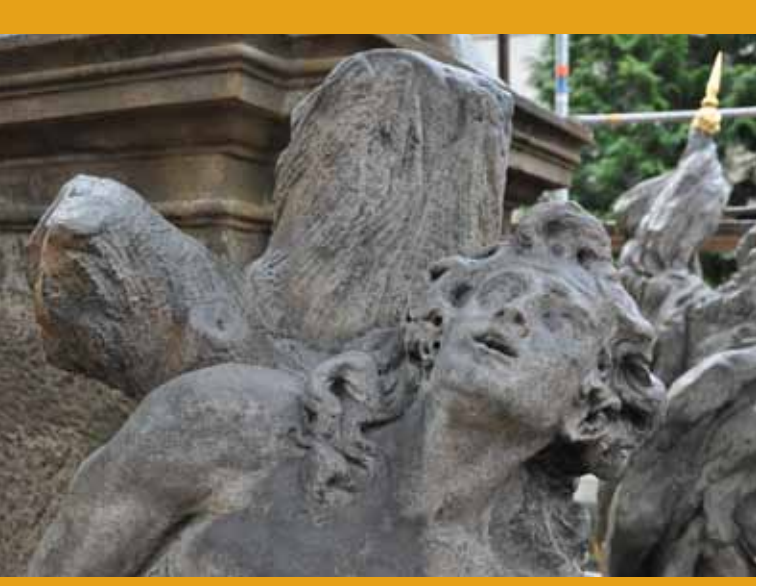
Statue of St. Sebastian, detail of the saint's chest and face.

The Column is a work of extraordinary beauty. A massive two-tiered octagonal pedestal with the plan of an isosceles cross rests on three sandstone steps, while four protruding pillars carry the statues of the four saints. The mass of the central part of the Column is relieved by a Baroque aperture in which a lamp once burned. It is worth noting that the lights on plague columns were often the only illumination of town and village squares at night. The second tier of the pedestal is formed by a square pillar, which bears three inscriptions at the bottom, one relating to the erection of the column and the other two to its restorations in 1830 and 1877. This central pillar, articulated like the first by rectangular cartouches and pronounced moldings, is topped by a statue of the Virgin Mary. The body of the Column is made of coarse-grained sandstone from the quarry in Křižany. The material used, the relatively simple forms, and records in the town accounts suggest that the base was not part of the gift from Karl Christian Platz, and was probably made by local artists or craftsmen.