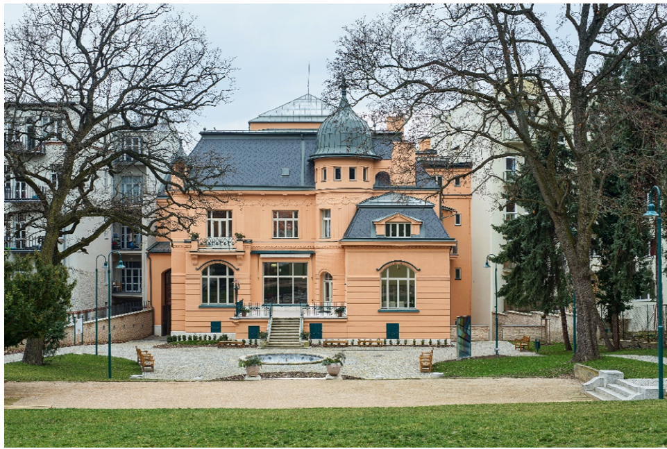
Villa Löw-Beer, National Heritage Institute

21.45 Return bus departure to the NCO NZO Hotel