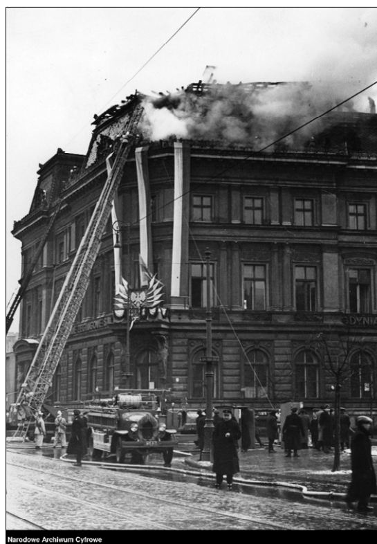
Kronenberg Palace on Fire in Warsaw, 1939.